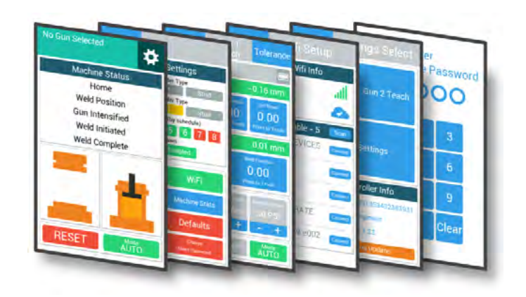
Simple Standardized Operator Interface